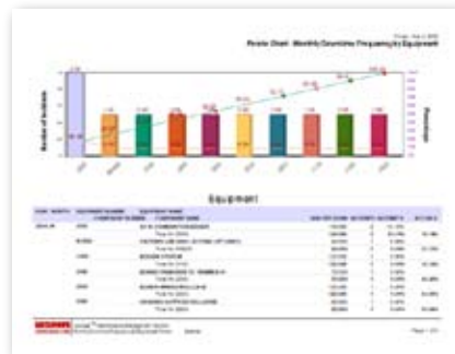
Over 400 standard reports are included.