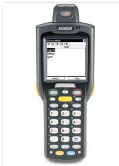
Take it with you. Mobile management software allows greater control over inventory and keeps maintenance costs to a minimum by making inventory counting, part disbursing, and meter reading faster, easier, and more reliable than ever before.