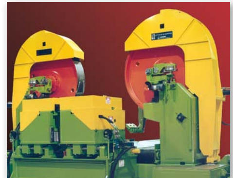
Vertical Twin Bandmill