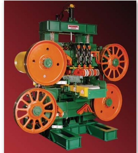
Horizontal Twin Bandmill