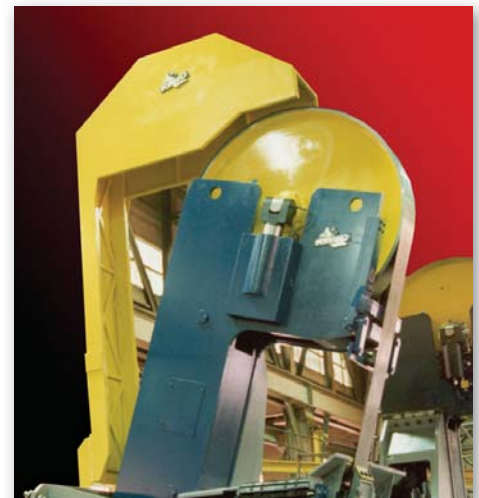
Slant Headrig Bandmill